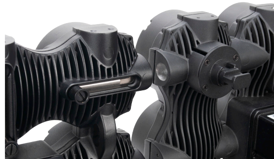
Fixture-to-Fixture Interlocking Alignment Pins/Locks