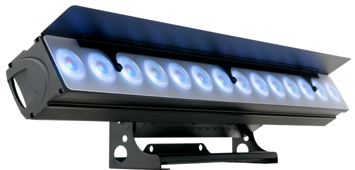
Glare Shield + Frost Filter Installed