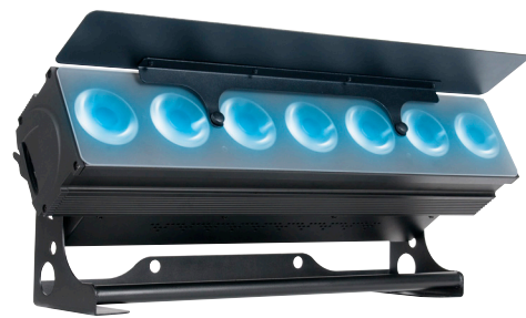
Glare Shield + Frost Filter Installed