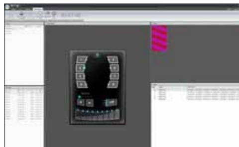
Stand Alone Screen